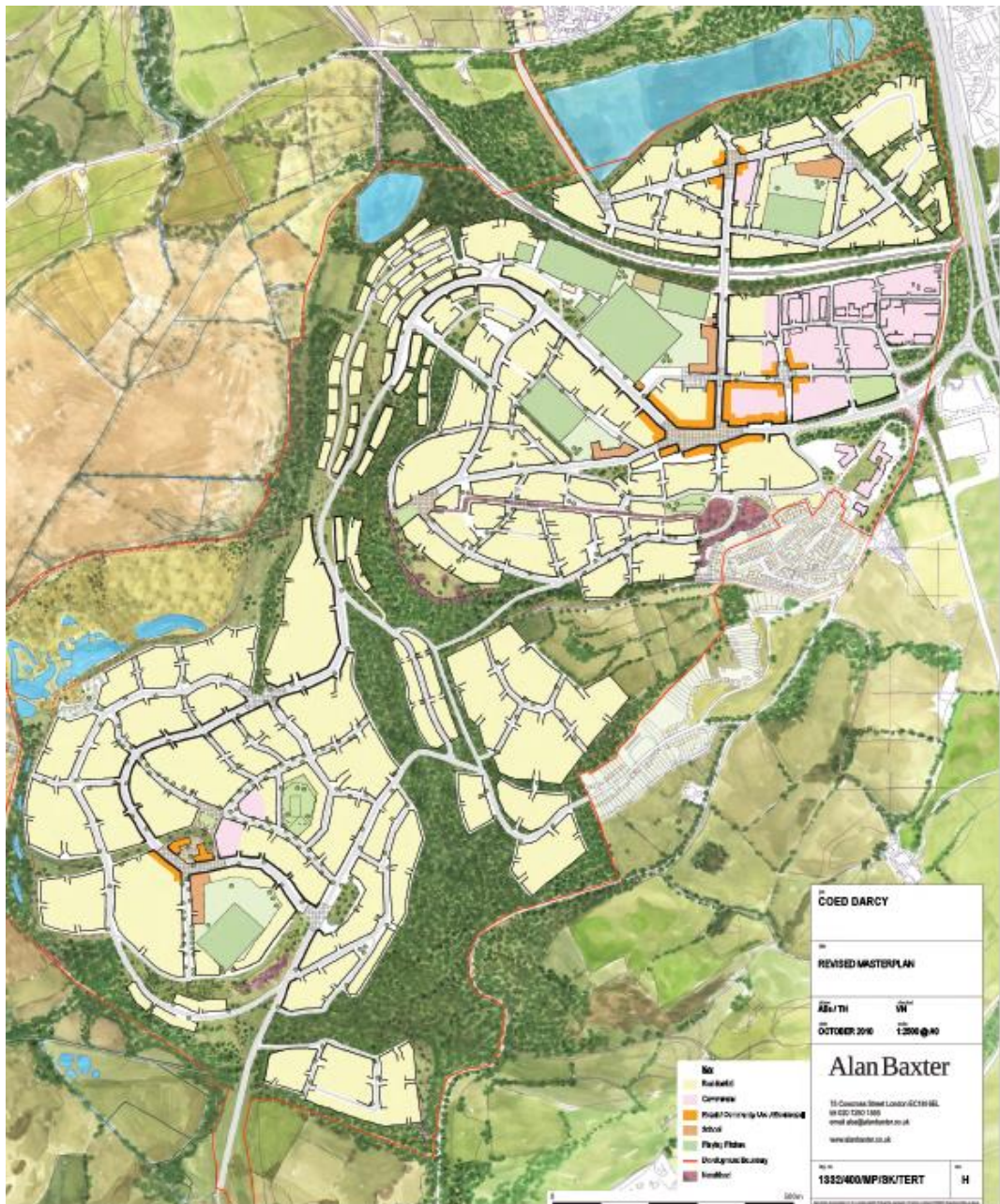
Figure 1 : Approved Masterplan